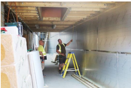
Insulation being fixed to outer wall of foyer before final plaster boarding is added