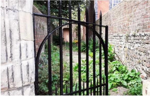
Freshly painted twitten gate, March 2024