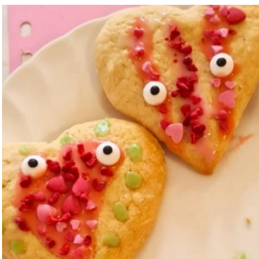
Baked in a recent children's meeting, March 2024

To give today, click on the following link: HOMELINK @ BRIGHTON 10K 2024