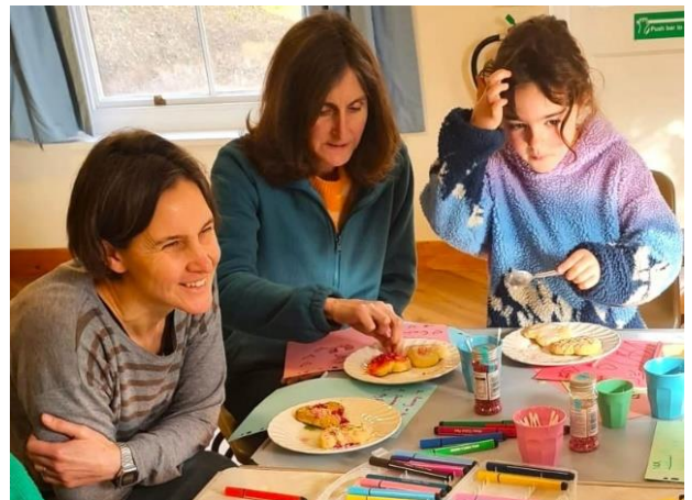
In children's meeting, March 2024

Please join an informal discussion on Sunday, 21 April at 12:15 p.m. Discussion groups are held on the third Sunday of alternate months, after meeting for worship. These friendly gatherings are for everyone, new attenders and seasoned Friends alike. Please bring a sandwich or packed lunch. Tea / coffee will be provided; the session will start promptly at 12:15 p.m.